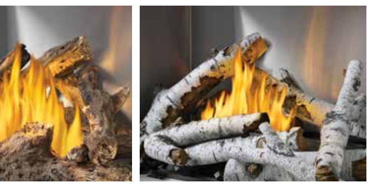
Must choose: Standard oak logs or high-definition birch logs