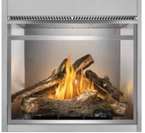
Safety screen kit