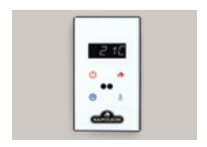
Optional wall mount controller with black and white faceplate