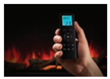
Premium remote with digital display

Connect to your phone so you can easily and conveniently control every feature of the fireplace from anywhere, even when you're not home.