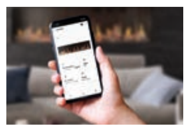
Control with the Napoleon Home app, Google Home, and Alexa-enabled devices